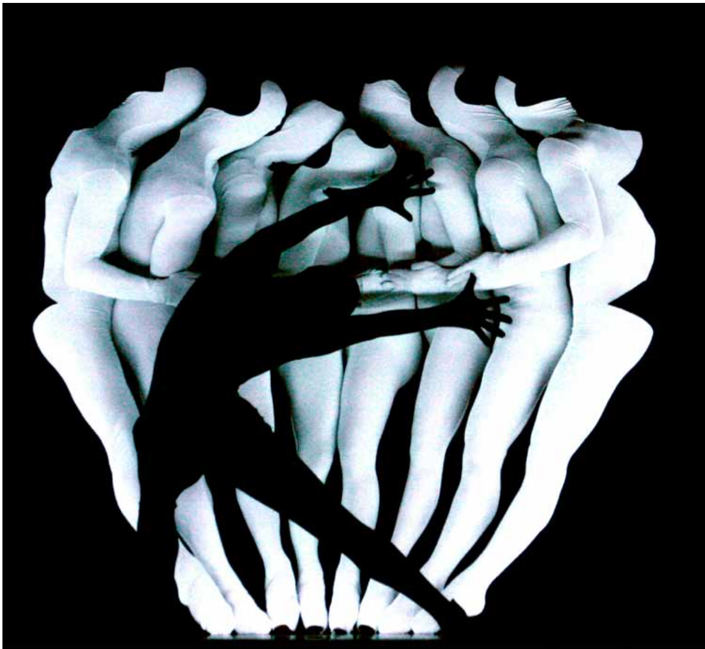
The uncanny dancer-illusionists of MOMIX showcased selections from the company's most dazzling productions on Jan. 21-22, 2010, at Scottsdale Center for the Performing Arts.