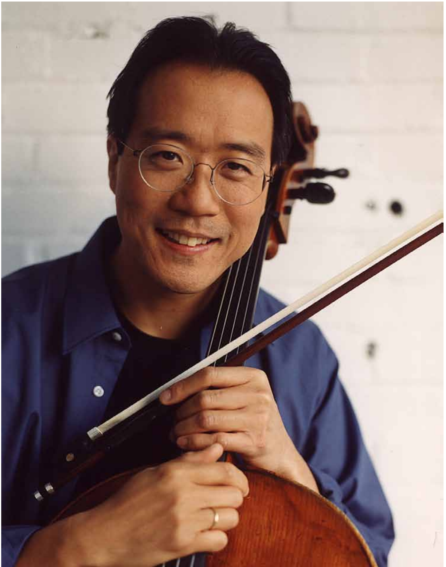
World-renowned cellist Yo-Yo Ma performed a selection of Bach's Suites for Unaccompanied Cello at Scottsdale Center for the Performing Arts on Dec. 4, 2009.