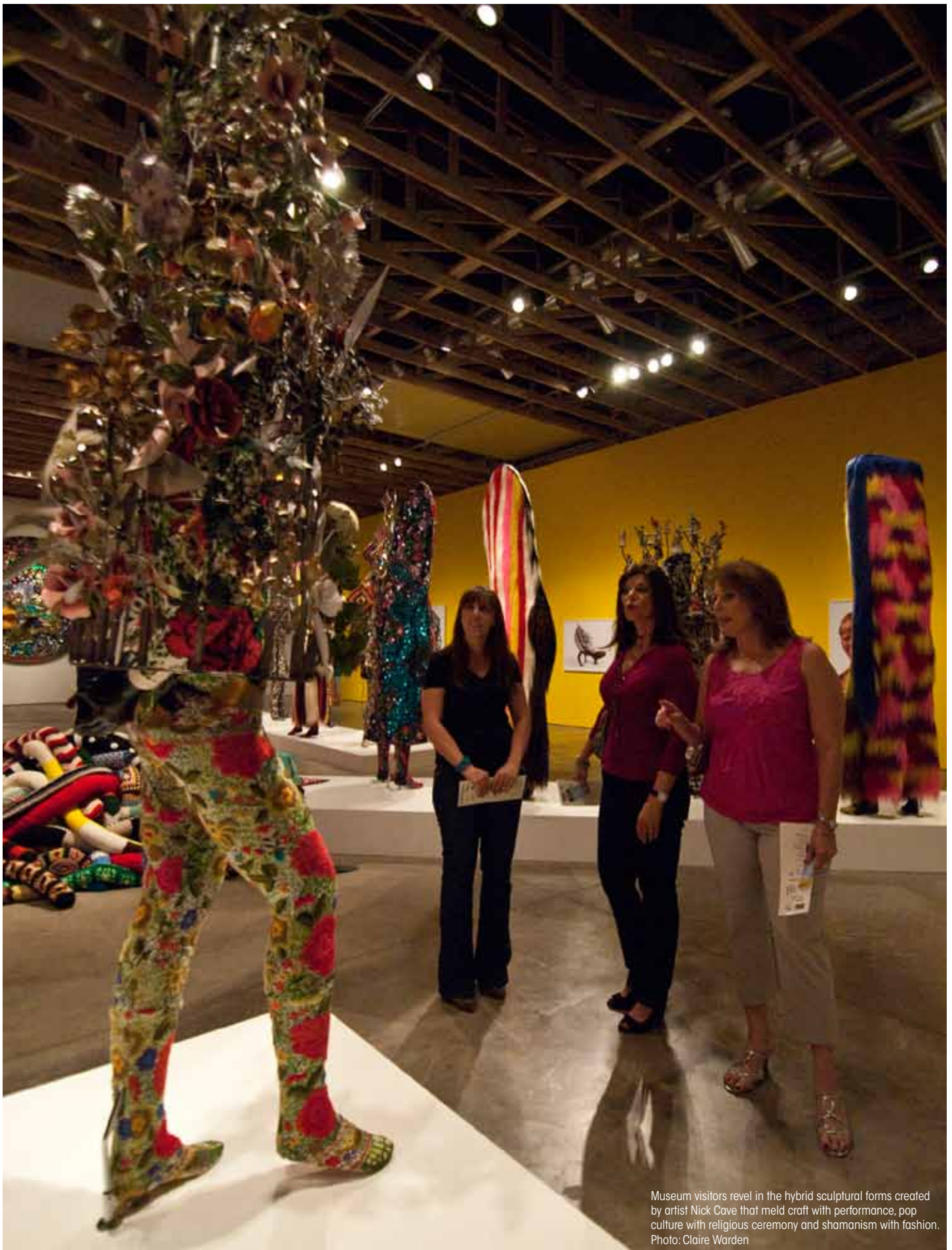
Museum visitors revel in the hybrid sculptural forms created by artist Nick Cave that meld craft with performance, pop culture with religious ceremony and shamanism with fashion.