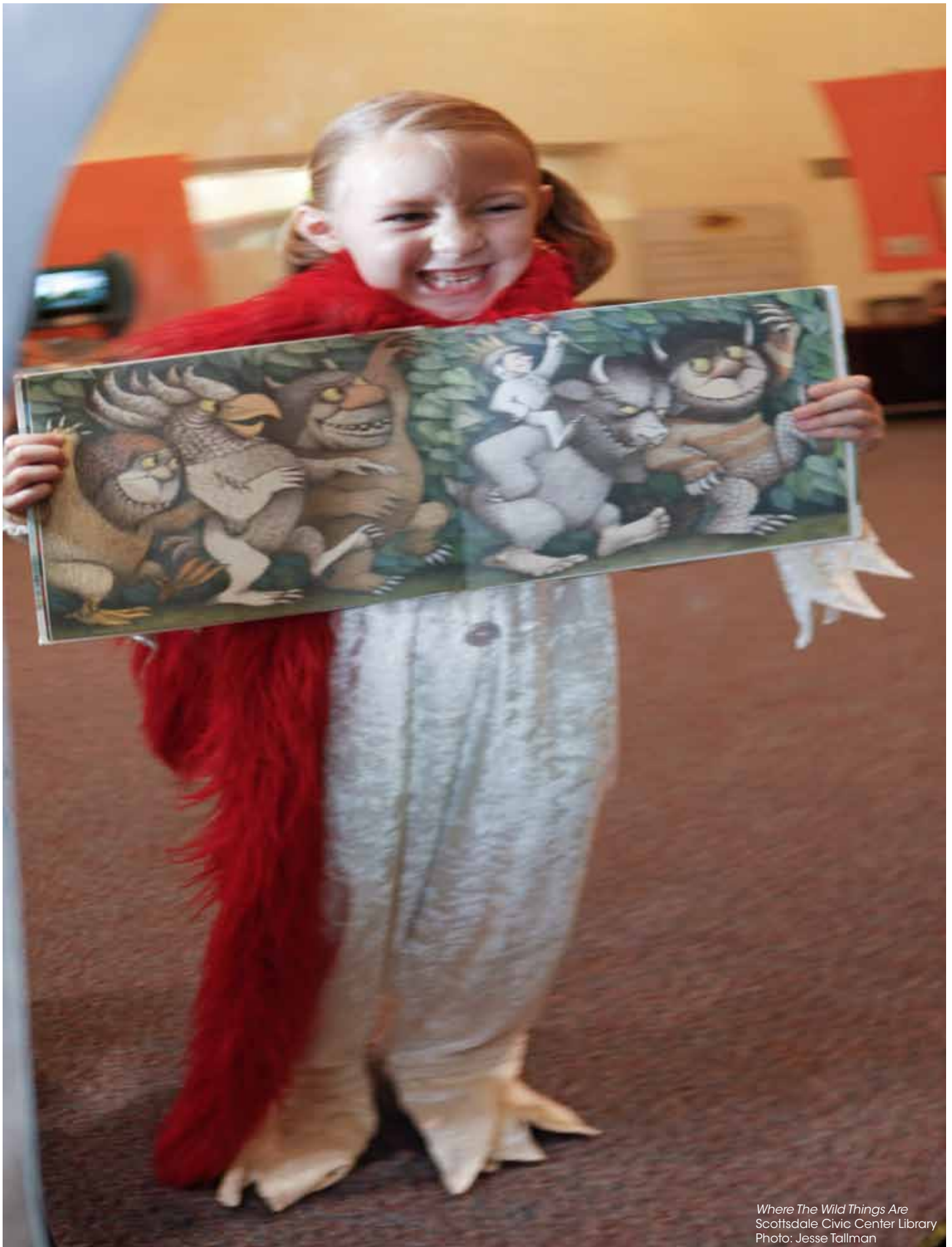
Where The Wild Things Are Scottsdale Civic Center Library