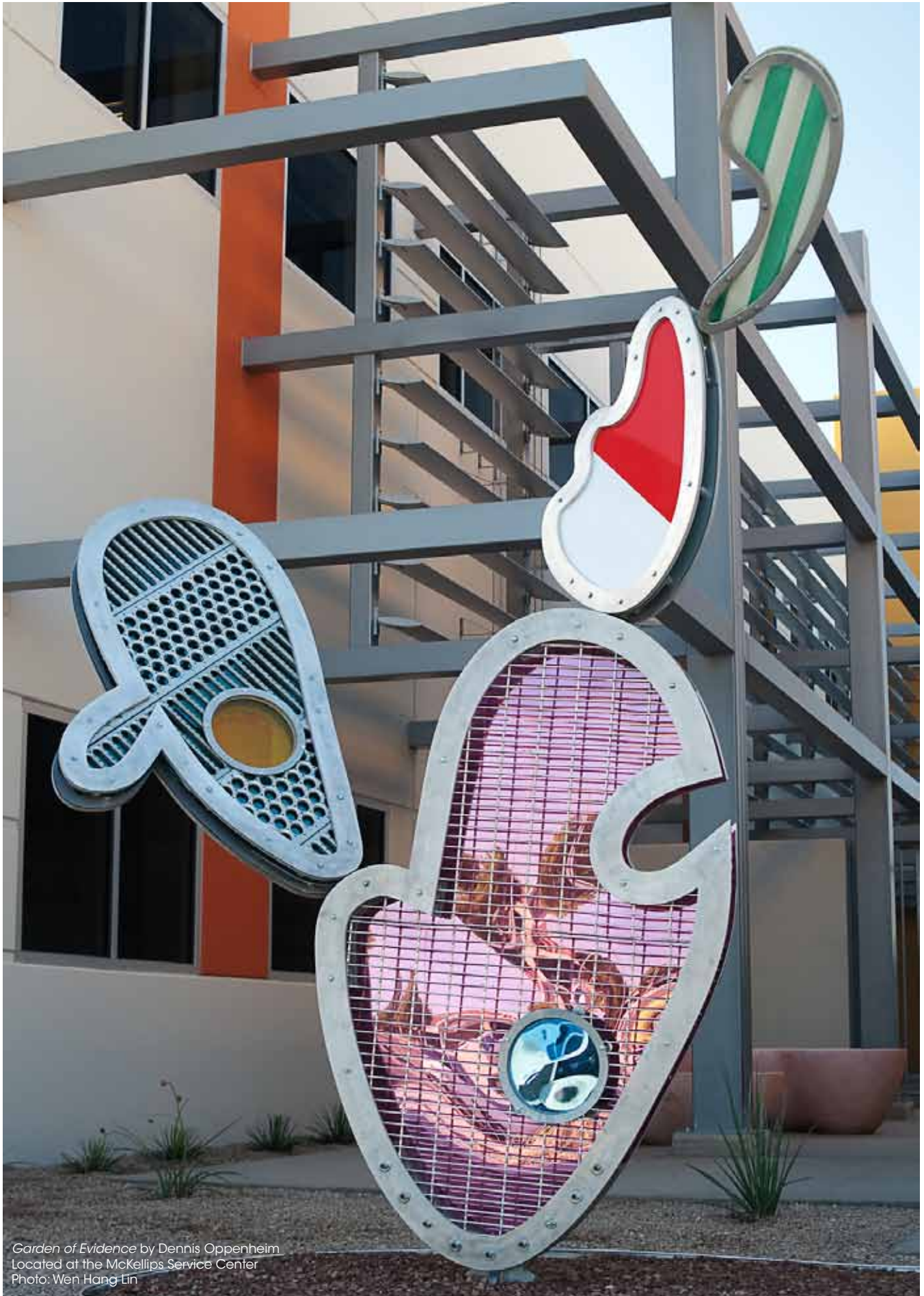
Garden of Evidence by Dennis Oppenheim Located at the McKellips Service Center