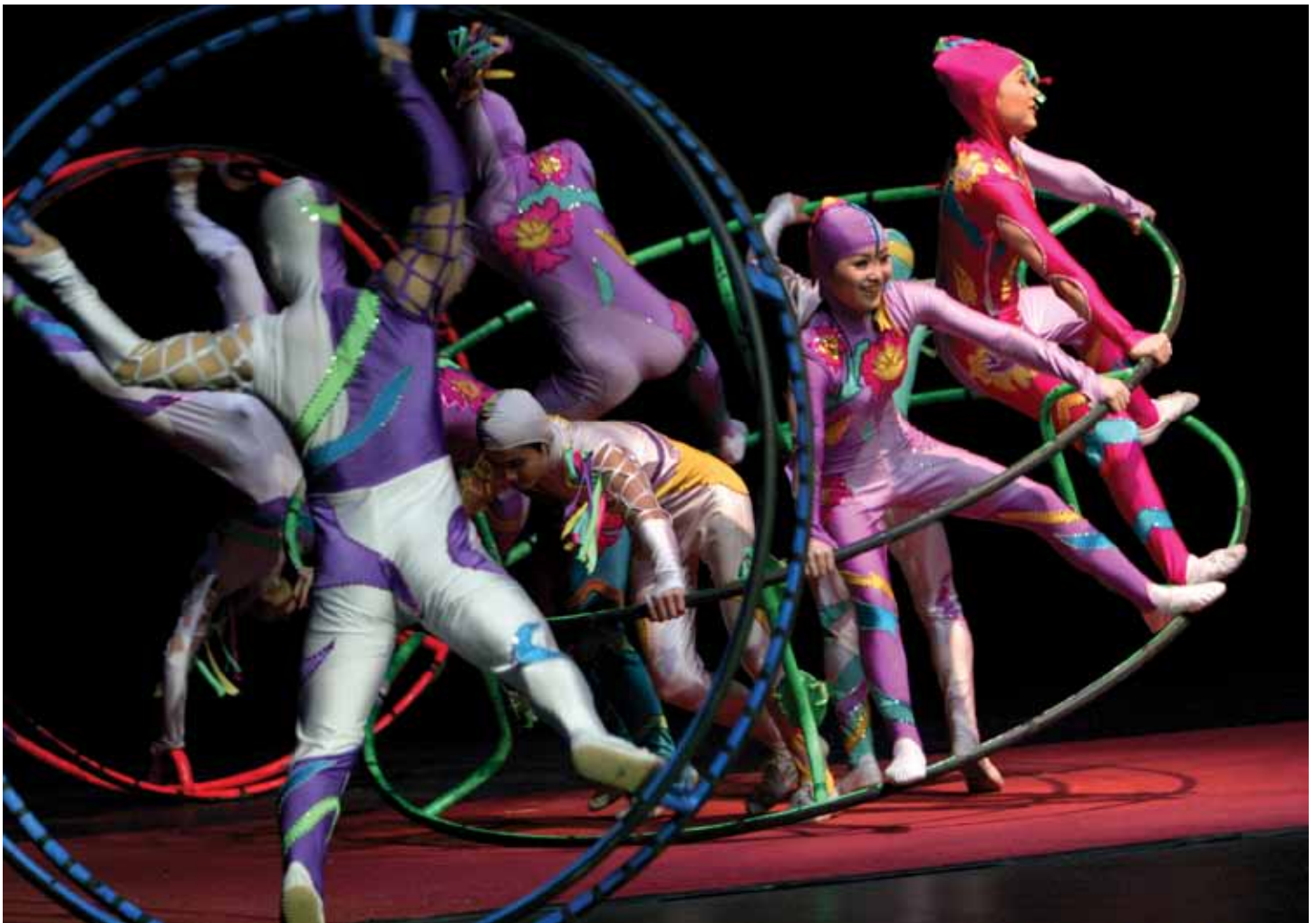
China's thrilling Golden Dragon Acrobats performed at Scottsdale Center for the Performing Arts as part of the new Destination China series on Dec. 5, 2009.

Empty Bowls is an international project to fight hunger, personalized by artists and arts organizations at the community level. The events are often held in conjunction with the United Nations sponsored World Food Day. Empty Bowls now supports food-related charities around the world and has raised millions of dollars in the fight against hunger. Scottsdale Center for the Performing Arts partnered with Scottsdale Community College and Scottsdale Unified School District for the Empty Bowls event on Dec. 2, 2009, which featured a sale of hand-crafted ceramic bowls by students and faculty from the Scottsdale Unified School District and children from the Paiute Neighborhood Center summer program and the Lights On Afterschool program. Proceeds from the event helped restock shelves at the Vista del Camino and City of Scottsdale's food banks.