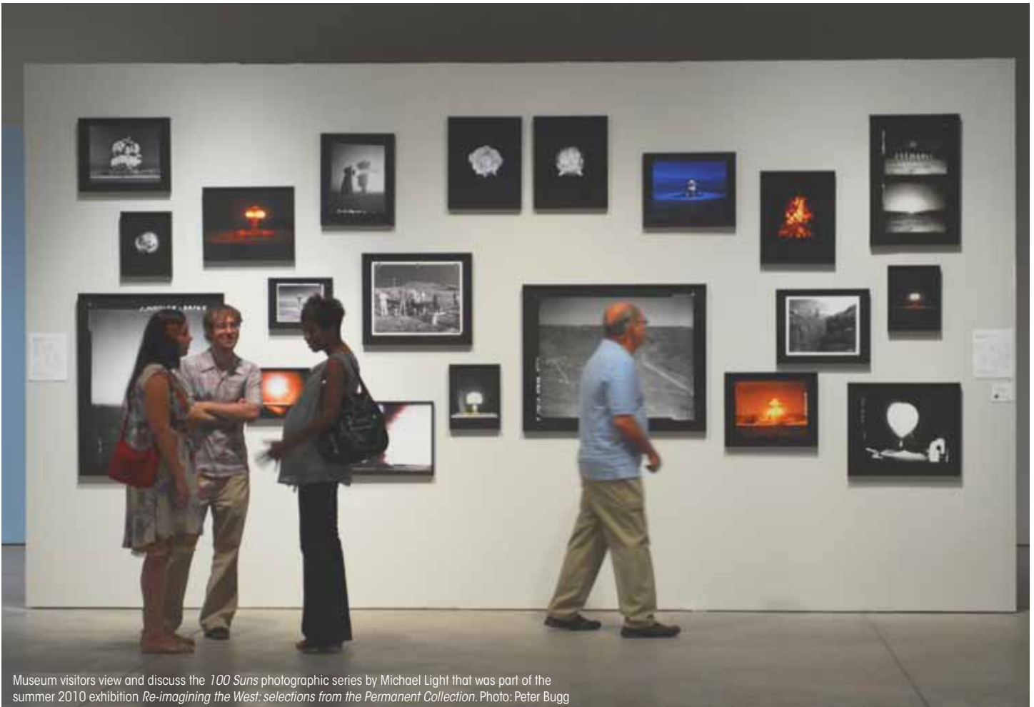
Museum visitors view and discuss the 100 Suns photographic series by Michael Light that was part of the summer 2010 exhibition Re-imagining the West: selections from the Permanent Collection .