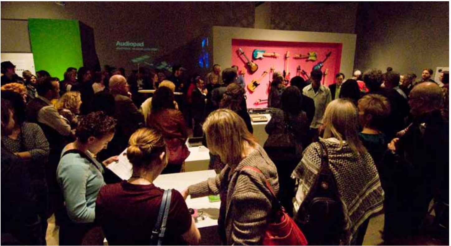
A buzzing crowd attends SMOCA's opening reception for the hit spring exhibition Rewind Remix Replay: Design, Music & Everyday Experience .