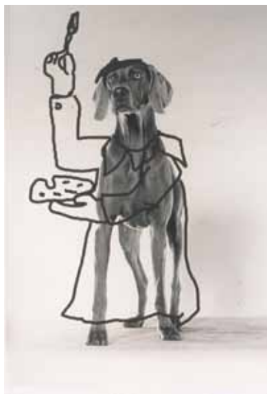
William Wegman, Role Models: Artist , 1986, Iris inkjet print on paper, 12 ½ x 9 ½ inches. Segura Publishing Company Archive, museum purchase. © William Wegman