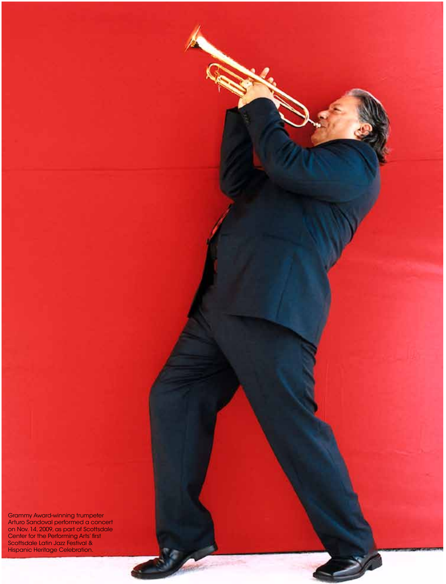
Grammy Award-winning trumpeter Arturo Sandoval performed a concert on Nov. 14, 2009, as part of Scottsdale Center for the Performing Arts' first Scottsdale Latin Jazz Festival & Hispanic Heritage Celebration.