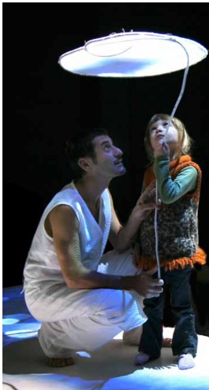
The acclaimed Italian children's theater troupe Compagnia TPO performed Farfalle (Butterflies) , an interactive theatrical experience for children, from June 8-13, 2010, at Scottsdale Center for the Performing Arts.