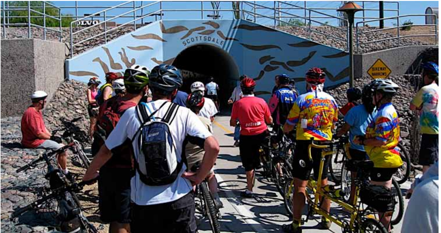
Swimmers Dream by Laurie Lundquist Located on the Crosscut Canal Featured on the Cycle the Arts tour, 2009